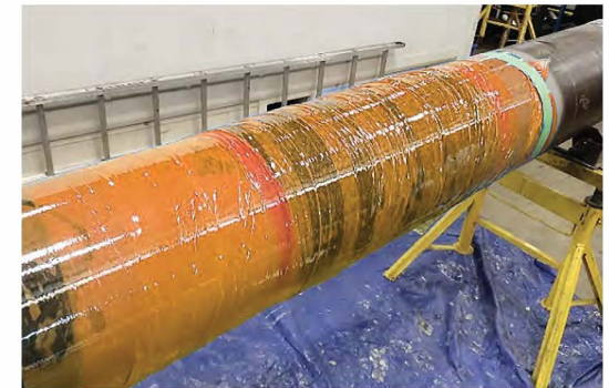
Installation completed with Deacon Jacket Wrap .