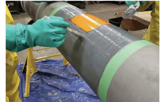
Wall loss region with Deacon Rocket Filler and Deacon Rocket Primer installed.