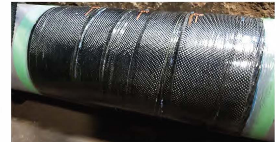
7-Layer repair installation complete.